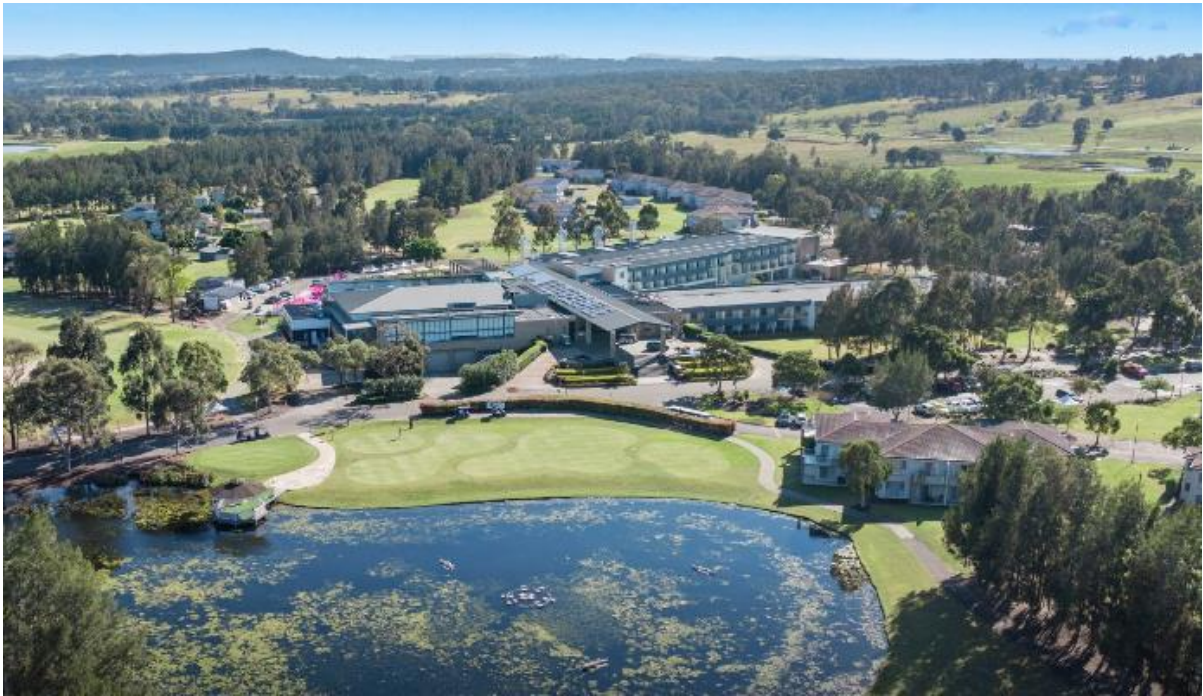
Rydge's Resort Hunter Valley

We will gather around the lands of the Wonnarua, Worimi, and Awabakal people. The Traditional Custodians have looked after these lands for thousands of years, and it continues to sustain them spiritually and physically. We pay our respects to their Elders, past, present, and emerging.