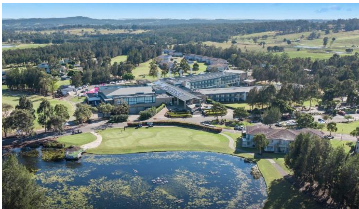
Rydge's Resort Hunter Valley

We will gather around the lands of the Wonnarua, Worimi, and Awabakal people. The Traditional Custodians have looked after these lands for thousands of years, and it continues to sustain them spiritually and physically. We pay our respects to their Elders, past, present, and emerging.